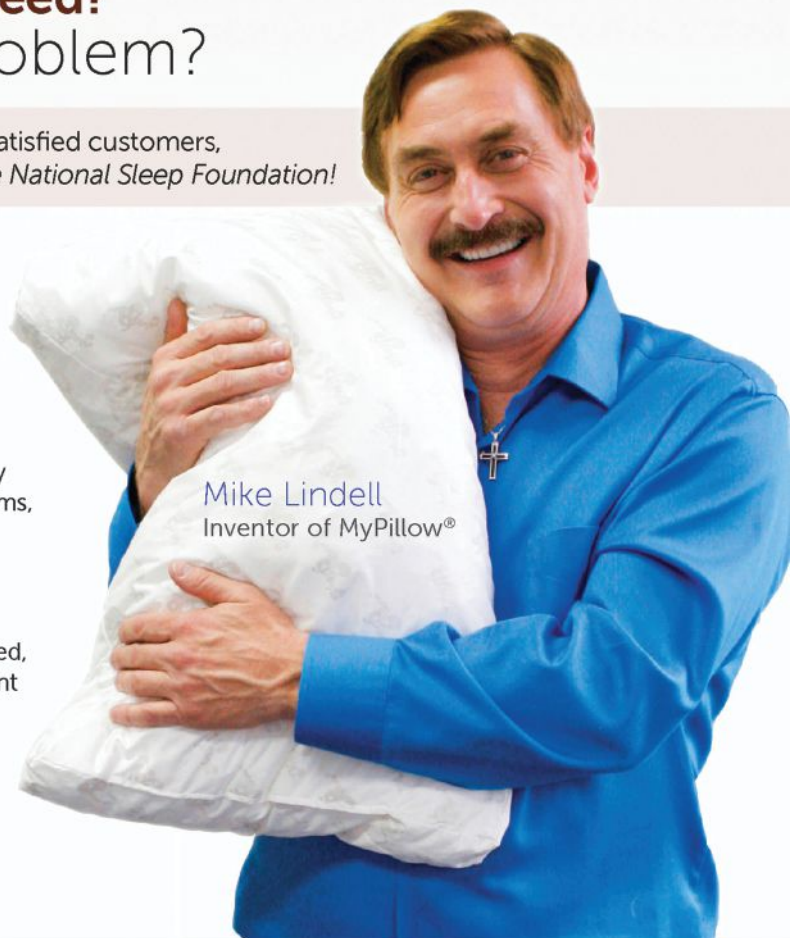
Mike Lindell Inventor of MyPillow®

I bought every pillow on the market that promised to give me a better night's sleep. No matter how many pillows I used, I couldn't find one that worked and finally I decided to invent one myself. I began asking everyone I knew what qualities they'd like to see in their "perfect pillow", and got many responses: "I'd like a pillow that never goes flat", "I'd like my pillow to stay cool" and "I'd like a pillow that adjusts to me regardless of my sleep position." After hearing everyone had the same problems that I did, I spent the next two years of my life inventing MyPillow.