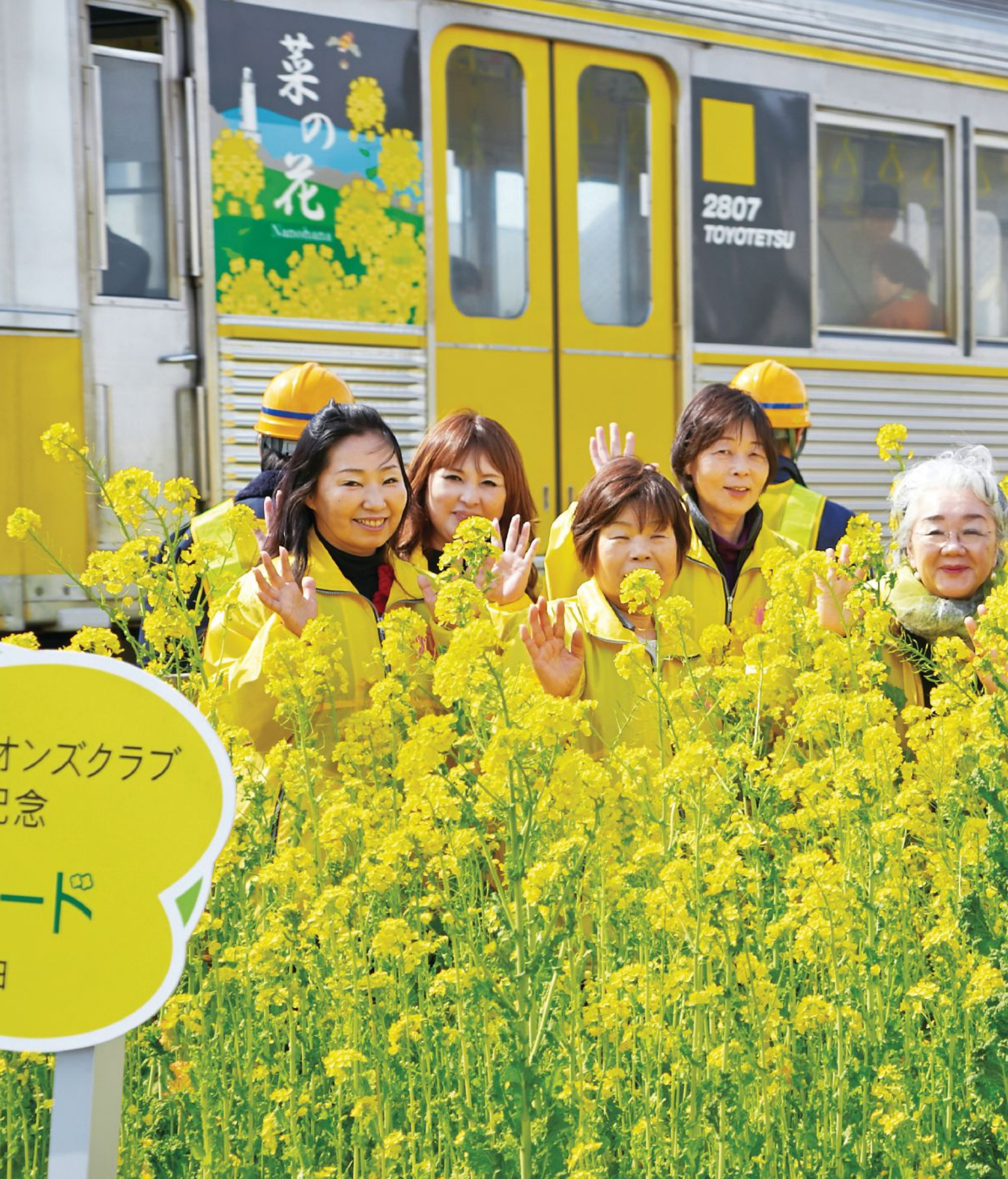
Service in Full Bloom Members of the all-women Aichi Nanohana Lions Club in Japan stand amid the canola flowers they planted at a train station to promote local tourism. The club partnered with schoolchildren and the Toyohashi Railroad Company on the project. Nanohana in Japanese means “wild flower.”