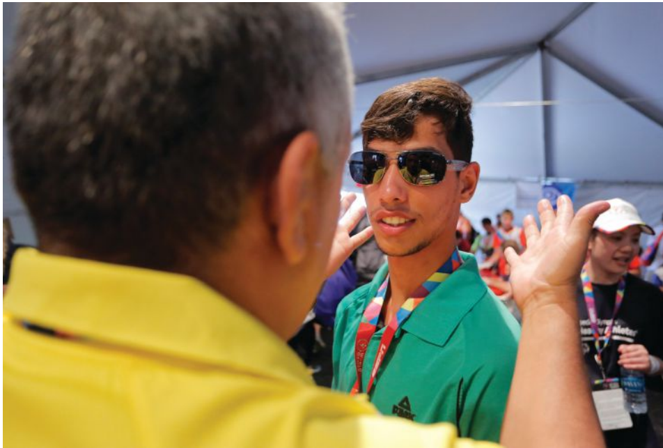
Glass with Class A Special Olympics athlete receives sunglasses at the 2015 Special Olympics World Games in Los Angeles. Lions helped staff the vision and hearing clinics at the University of Southern California.