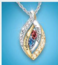
Shown actual size

Reservations will be accepted on a first-come, first-served basis . Respond as soon as possible to reserve your pendant.