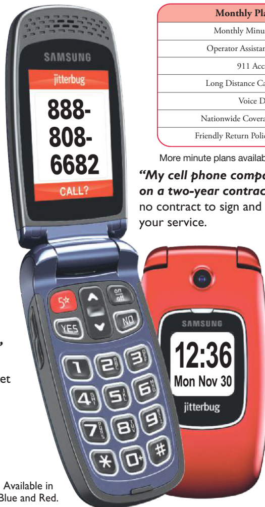
Available in Blue and Red.

“I’d like a cell phone to use in an emergency, but I don’t want a high monthly bill.” Jitterbug has a plan to fit your needs... and your budget.